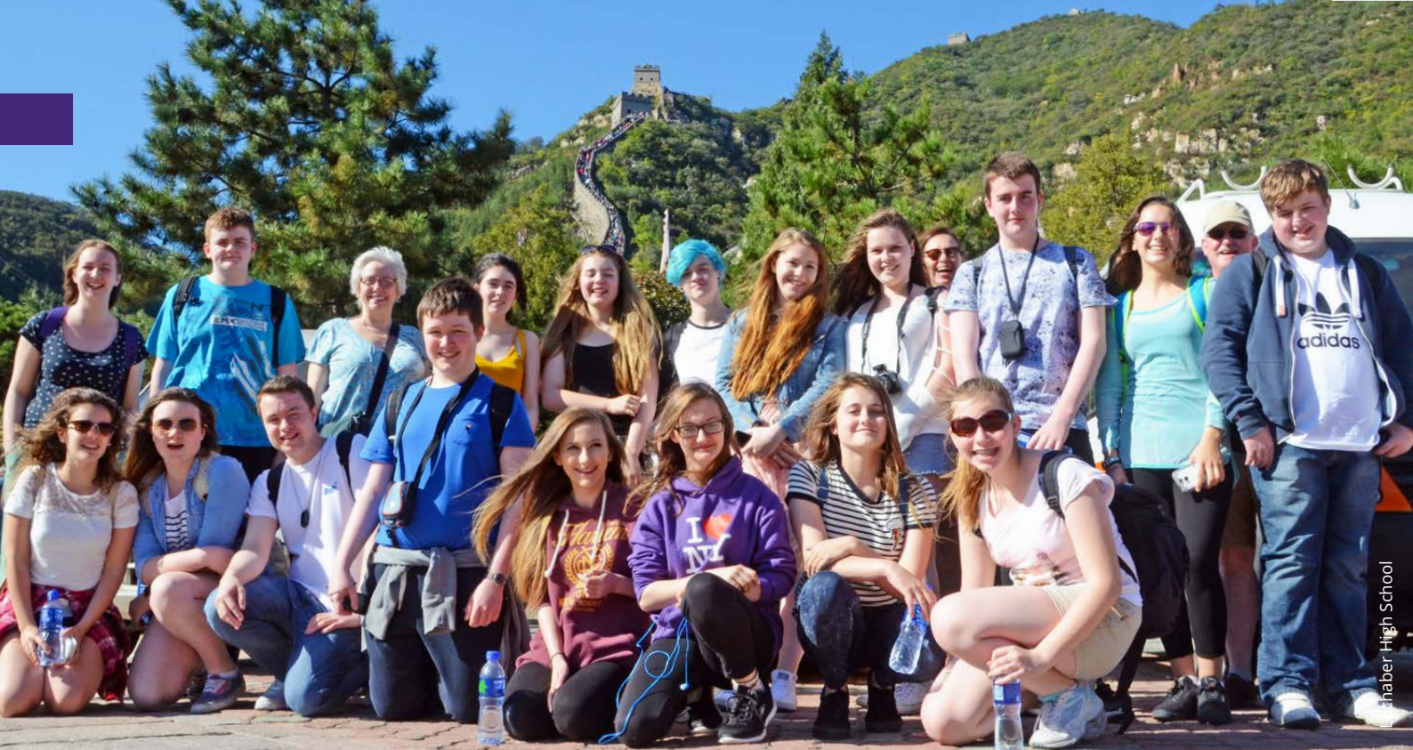
Harber High School