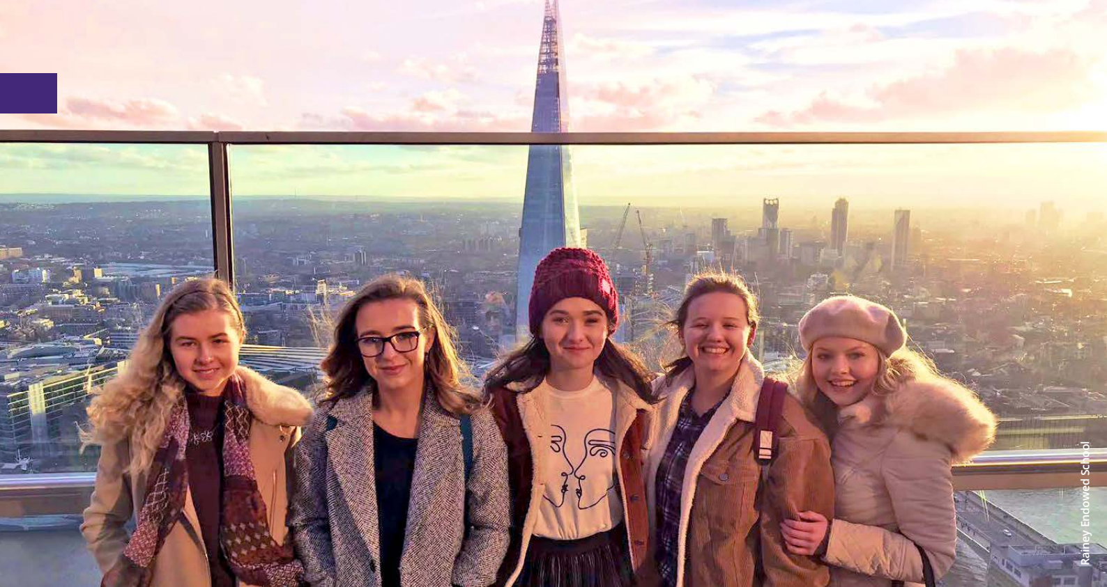
Rainey Endowed School