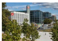
Meininger Hotel Berlin Central Station