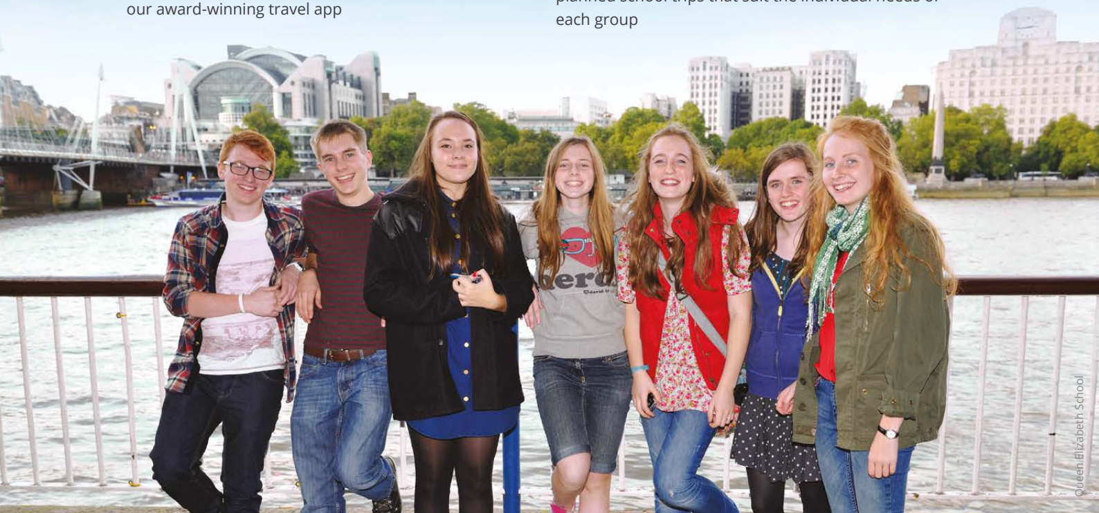
Queen Elizabeth School

Looking for a helping hand for your next school trip? Get in touch today.