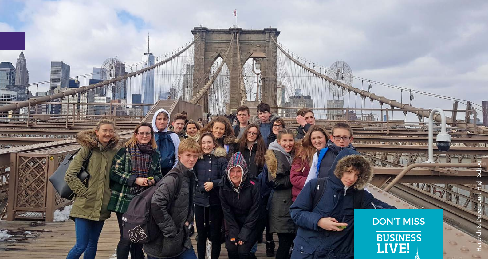
Harwich & Dovercourt High School

DON'T MISS BUSINESS LIVE! in New York 18 th February 2020